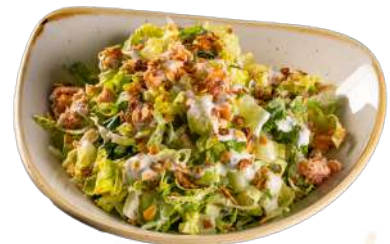
Chia & Salmon Salad