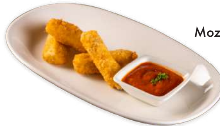
Mozzarella in Carozza