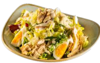
Garlic Chicken Salad