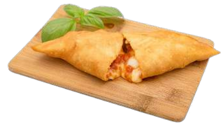
Panzerotto Classico (Fried Pizza)