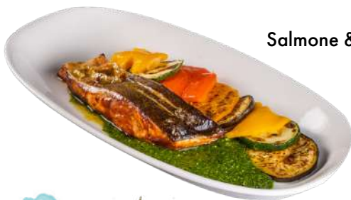
Salmone & Pesto