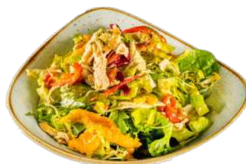
Spicy Chicken Peppers Salad