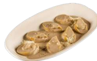
Spinach & Mushroom Tortelli