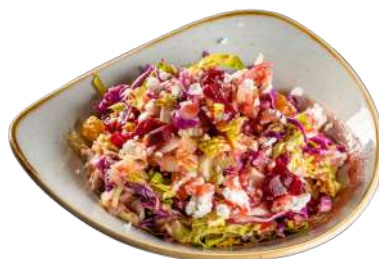
Ruby Red Salad