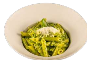
Penne Pesto & Pollo

Our Chefs will do their best to accommodate your dietary requirements, please inform your waiter.