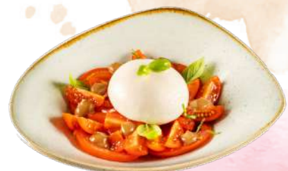
Burrata Pomodoro (Full)

Our Chefs will do their best to accommodate your dietary requirements, please inform your waiter. All prices are inclusive of 5% VAT.