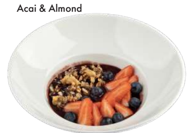
Acai & Almond