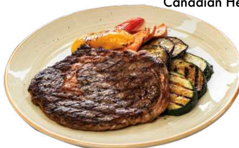
Canadian Heritage Ribeye